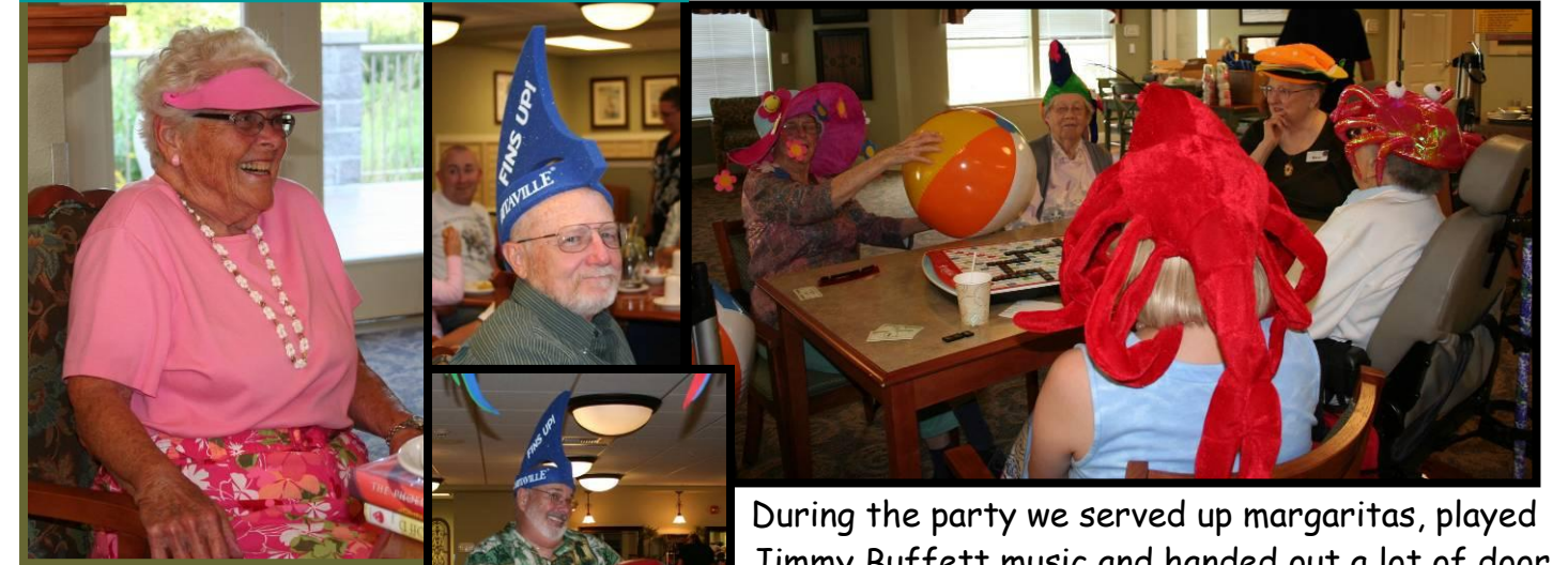
Residents turned into Parrotheads for the evening.

Sea View residents and guests had a fun-filled evening on August 18 th with a beach party that celebrated the songs and amusements of Jimmy Buffett. Before the party even started our Scrabble players tried on some hats that you would likely see if you attended a Jimmy Buffett concert.