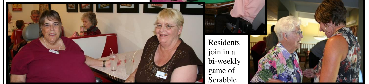
Residents join in a bi-weekly game of Scrabble