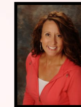
Angie Kay Marketing