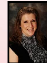
Jessica Throop Memory Care