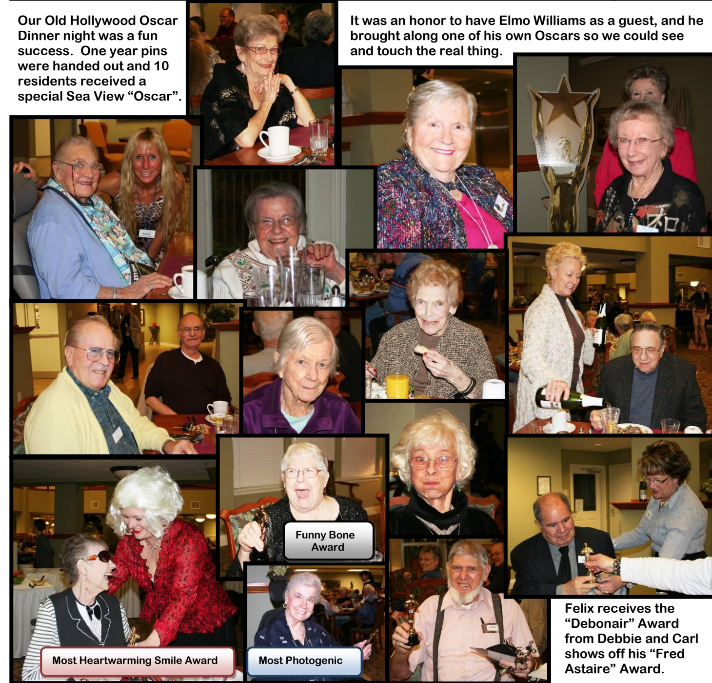
Most Heartwarming Smile Award