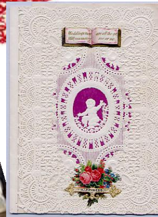
Esther Howland 1850