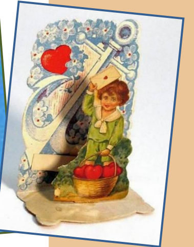
Hallmark's 1 st Valentine's Day Card