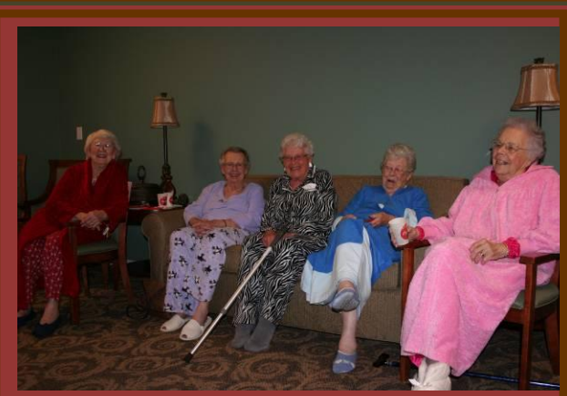
Ladies' Pajama Party