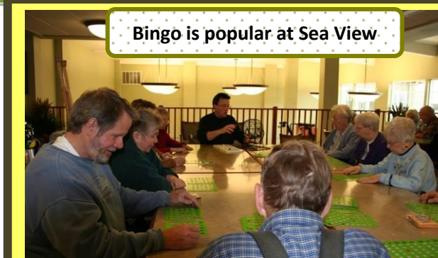
Bingo is popular at Sea View